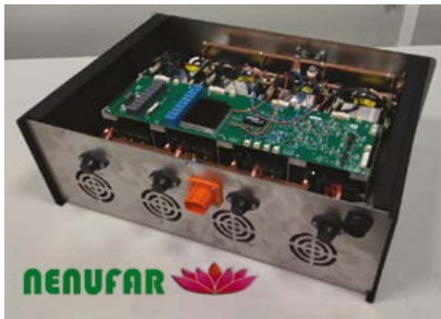
▲ Converter test with battery