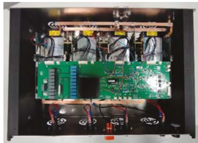
▲ Complete converter with four parallel modules